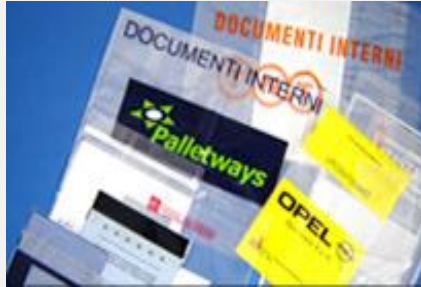
PAC MAIL: CATALOGUE TRANSPARENT ENVELOPE