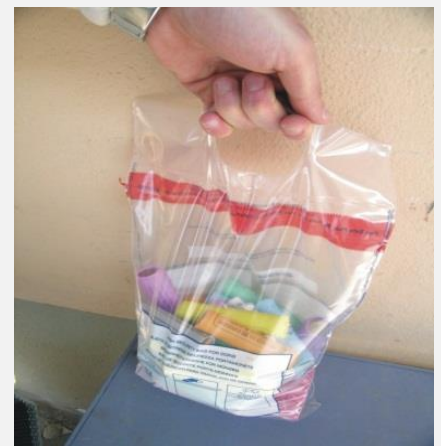
COIN BAG: SECURITY ENVELOPE FOR CASH-IN-TRANSIT