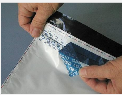
PAC SAFE PLUS: SECURITY ENVELOPE WITH "VOID" TAPE AND NUMBERING.