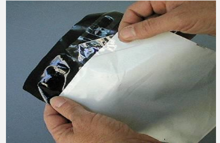
PAC PLUS: SECURITY ENVELOPE WITHOUT NUMBERING