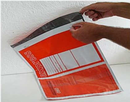
PAC SAFE: SECURITY ENVELOPE WITH NUMBERING