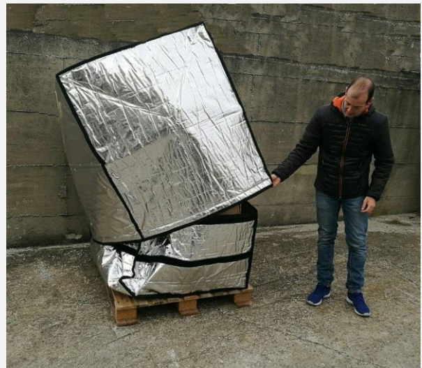
Art: TD 005