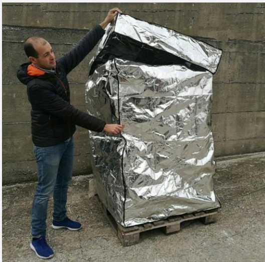
Art: TD 001

In summer, with high temperatures, the layer of film is optimised for reflecting infrared radiations and keeping an optimal temperature for all the period of shipment