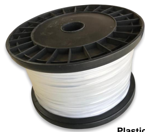
Plastic flange spool