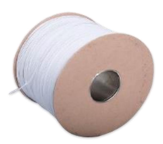
Carton flange spool