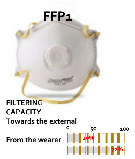
FFP1 – FFP2 – FFP3 with valve They all have one thing in common: they allow a better breathing. They provide just one way of protection (for the wearer) . The mask FFP3 has almost a total protection

FILTERING CAPACITY Towards the external From the wearer