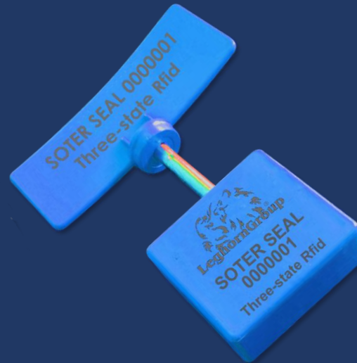
RFID Soter seal: RFID high security seal for container