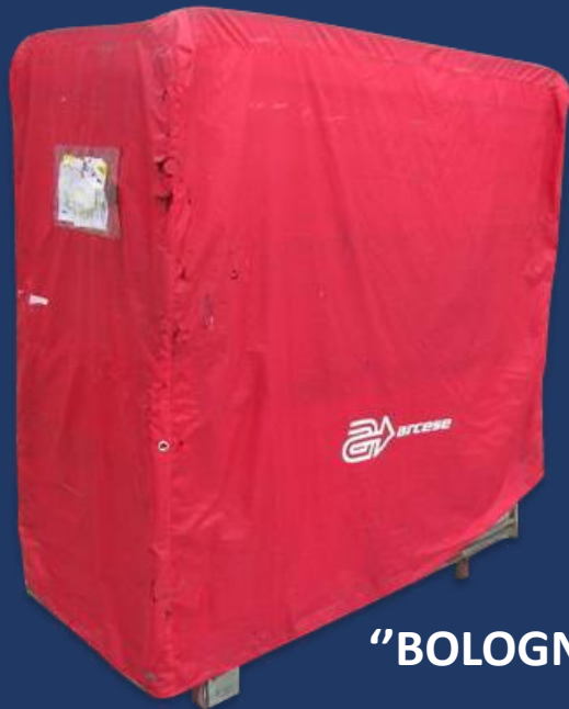
"BOLOGNA" pallet cover

Therefore, this type of solution allows to cover all the goods of the pallet that can no longer be easily tampered with