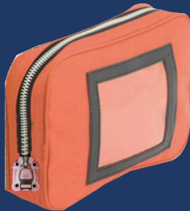
Barcellona bag for keys