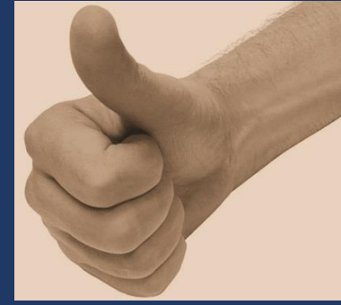
The right product