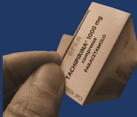
Security labels for pharmaceuticals products