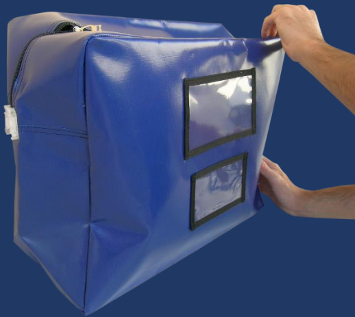
"Hamburg" bag for documents

All security bags can be sealed with a progressive and customized seal.