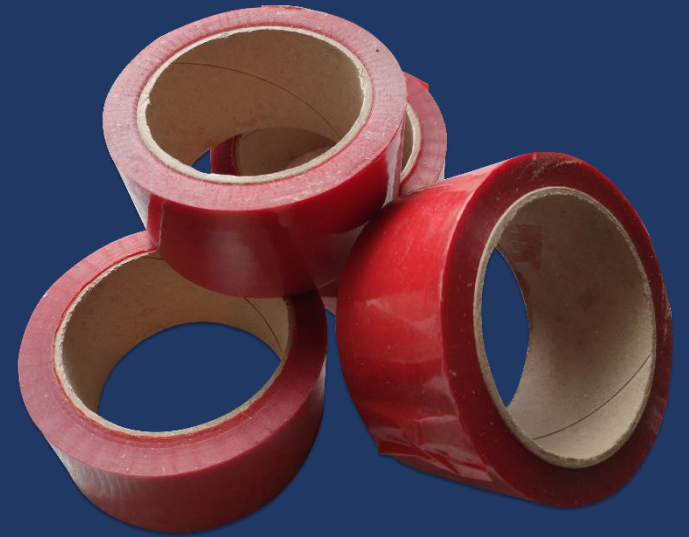
Tamper evident tapes