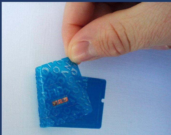
RFID VOID labels without residu

We support the customer in the technical choice of the best combination of RFID chip, memory and antenna, depending on the required performance in the specific use case.