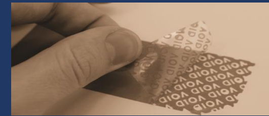
Void labels with residu