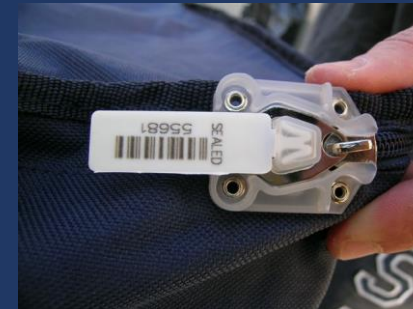
"LION" security bag with security seal