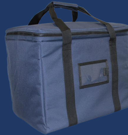
Helsinky bag for cash and transit