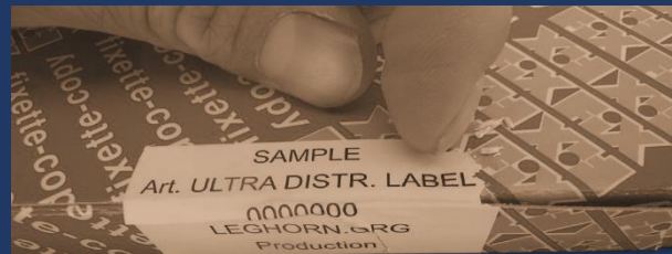
Ultra destructibles labels