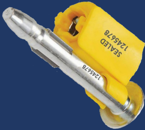
MECHANICAL Neptune seal: High security seal for container

Each type of seal listed, if it is also made in RFID technology version, offers significant benefits since it cannot be replicated/cloned (unique number) and it can be tracked automatically. Electronic seals are also essential devices to support digitisation of operations and paperless data exchange across supply chains.. Finally, electronic seals provide a range of additional information related to the monitoring of the supply chain and communication of unauthorised access.