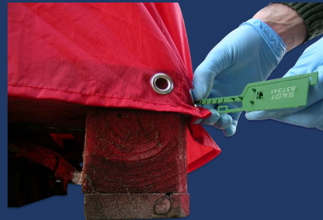
Seal for pallet cover