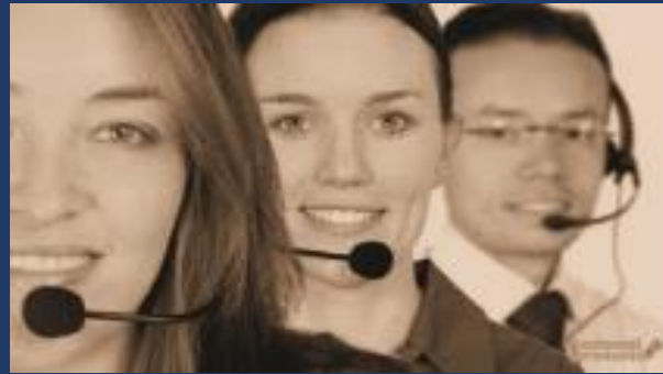
Tamper evident experts