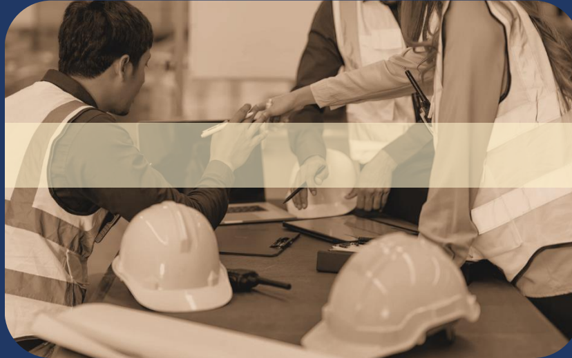
Tamper evident experts

LeghornGroup works with the most important consumer product companies, with the main international transport players and with electricity/ water/ gas distributors, by solving daily dozens of extremely different problems related to any type of tampering.